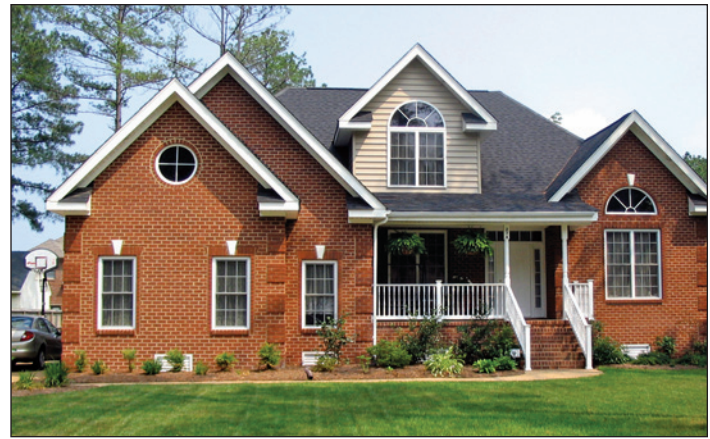
Elevated home on crawl space foundation

make conventional loans for insurable buildings in flood hazard areas of non-participating communities. However, the lender must notify applicants that the property is in a flood hazard area and that the property is not eligible for Federal disaster assistance. Some lenders may voluntarily choose not to make these loans.