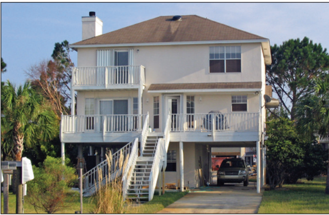
Elevated home on pile foundation