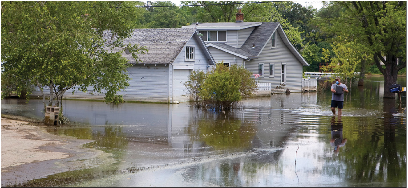
Janesville, Wisconsin, 2008