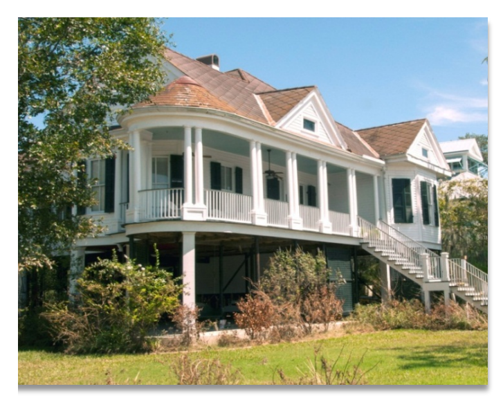
Figure 1: House elevated above the BFE with 1 foot of freeboard

Communities that incorporate freeboard into their local floodplain ordinances can earn discounts on flood insurance by participating in the NFIP's Community Rating System (CRS) program. CRS rewards communities that engage in floodplain management activities that exceed NFIP standards by offering discounts of up to 45 percent on flood insurance policies written for SFHAs in NFIP-participating communities.