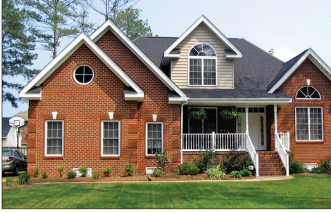
Elevated home on crawl space foundation

make conventional loans for insurable buildings in flood hazard areas of non-participating communities. However, the lender must notify applicants that the property is in a flood hazard area and that the property is not eligible for Federal disaster assistance. Some lenders may voluntarily choose not to make these loans.