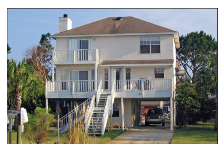
Elevated home on pile foundation