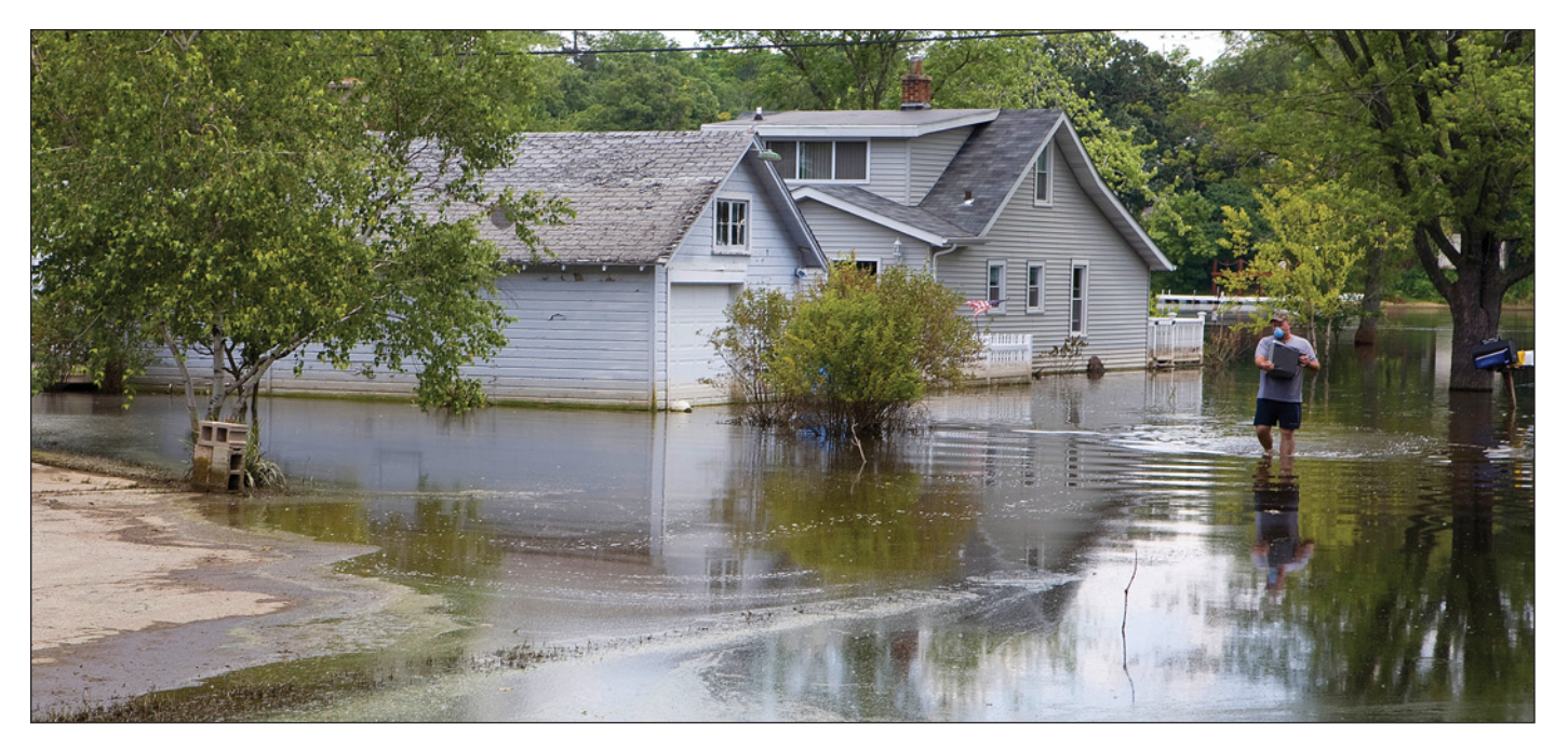
Janesville, Wisconsin, 2008