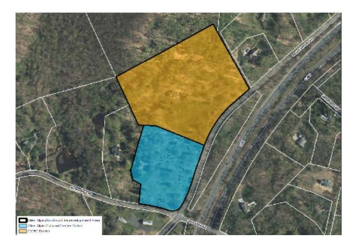
Replace CCRC District with Senior Living District in this map.