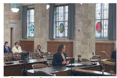
Surrogate Darling testimony before NJ State Senate Judiciary Committee

To further enhance Surrogate Darling's endeavor for easy and convenient service at the Surrogate's Court, she has worked with the New Jersey State Legislature to bring about legislation for both the electronic signature on qualifying documents and for the electronic wills. Senate Bill, No. 828 would