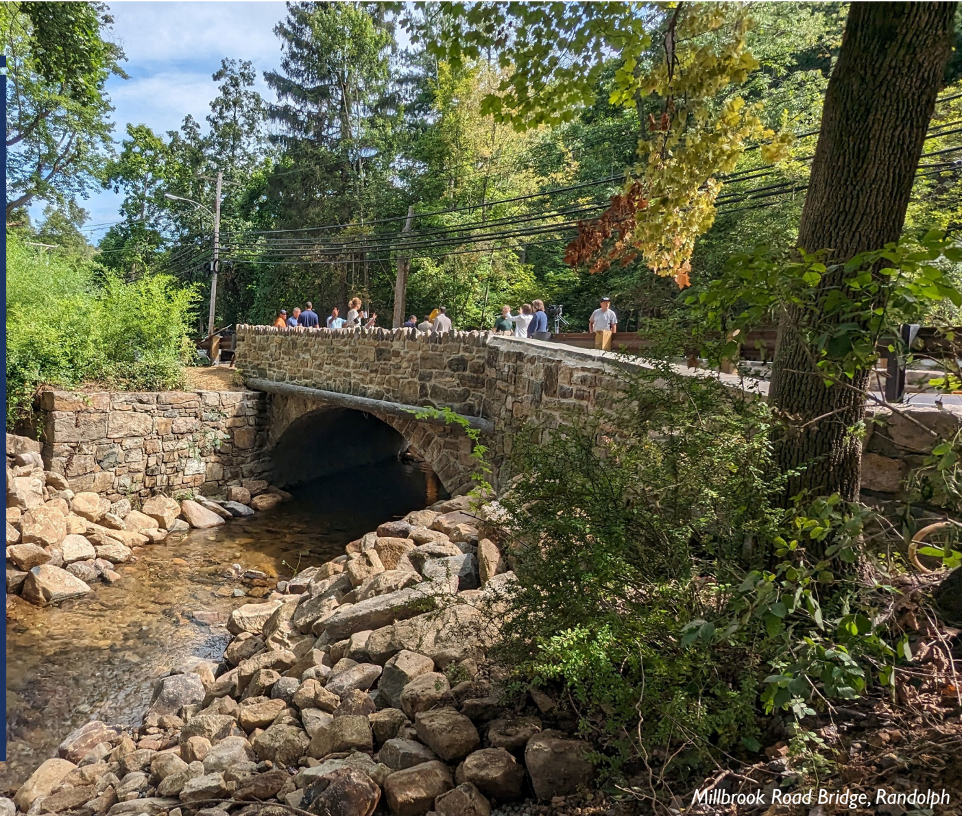
Millbrook Road Bridge, Randolph