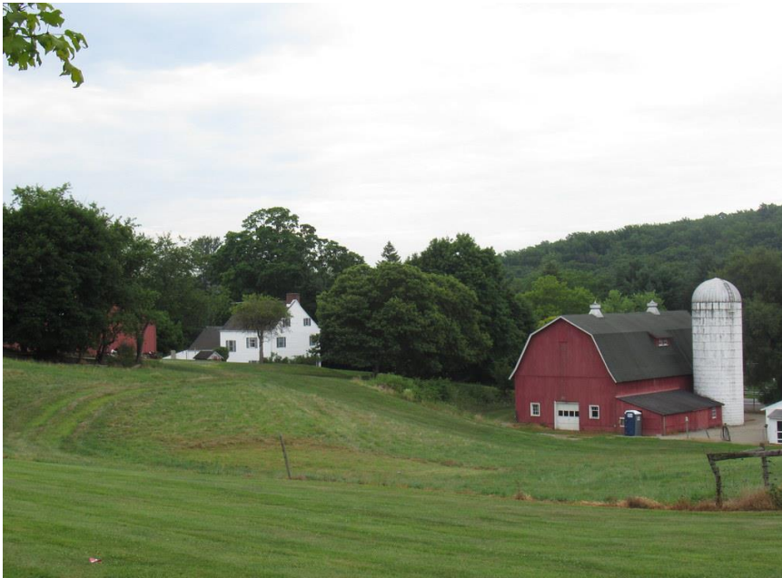
Parks Farm, Chester Township

The Preservation Trust Fund Tax will stay level for 2024, at 5/8 cent per $100 of total county equalized property valuation. It has financed county park improvements, preservation programs and restoration projects through these popular grant programs: