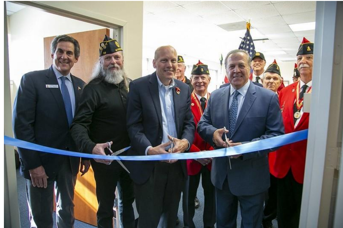
Commissioners dedicate expanded Veterans Services Office, Nov. 2023