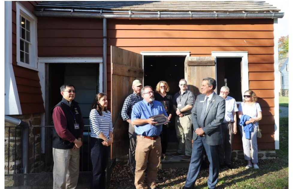
Historic Speedwell Wheelhouse Dedication, Oct. 2023