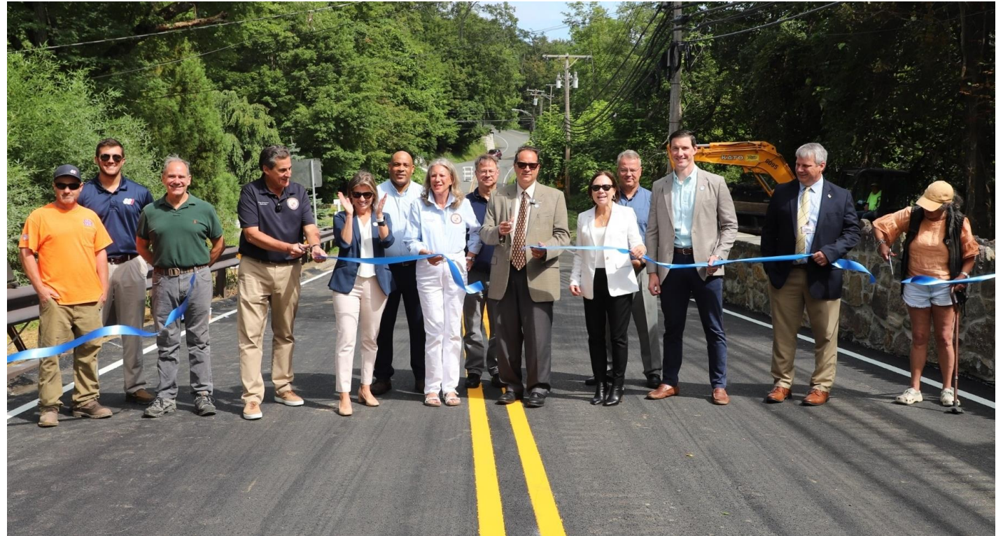
Millbrook Avenue Bridge Dedication, Randolph, Aug. 2023