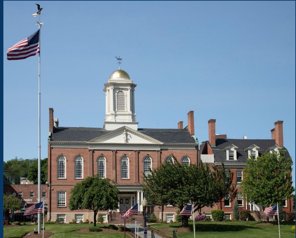
Historic County Courthouse