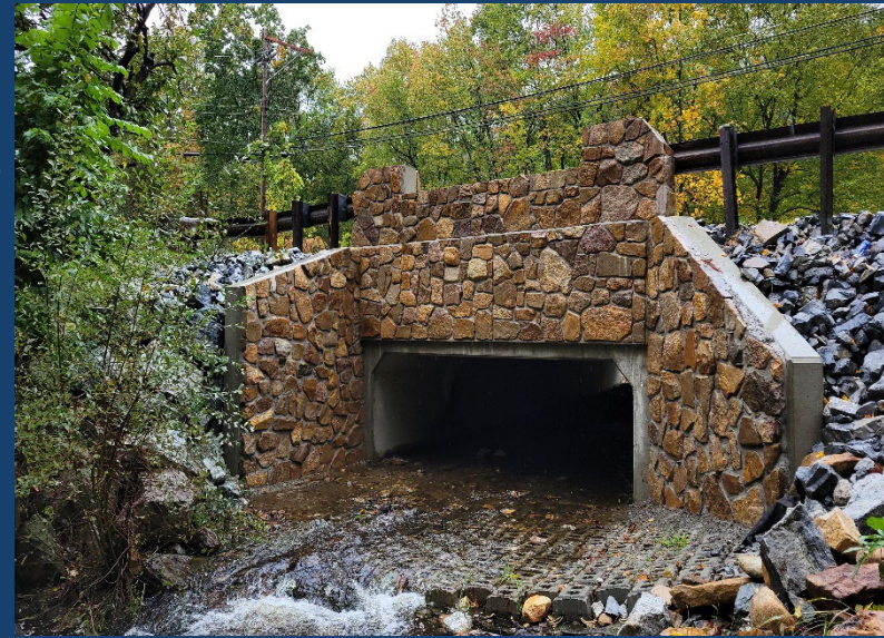
Berkshire Valley Road, Township of Jefferson