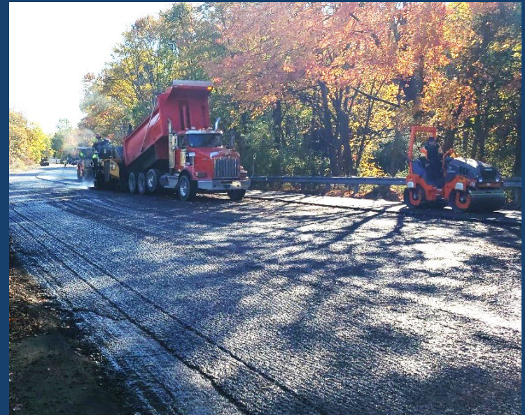
Bartley Road Mt. Olive and Washington Townships