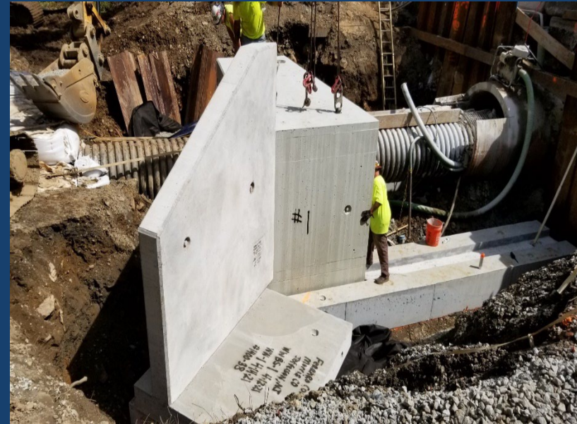
Berkshire Valley Road, Township of Jefferson