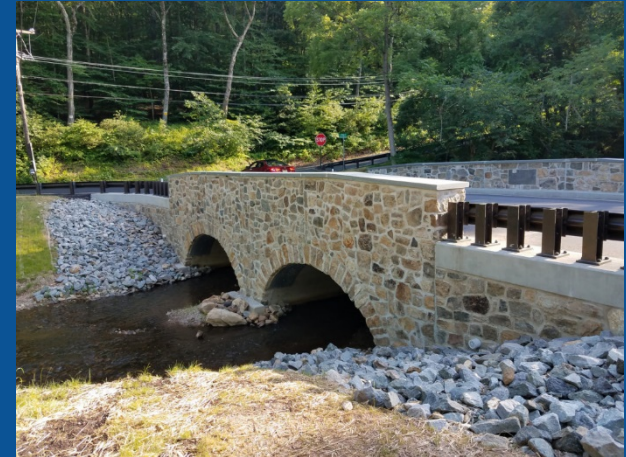
Historic 117 year old Flanders-Drakestown Road bridge was replaced in 2018

Planned bridge projects in 2019 include: