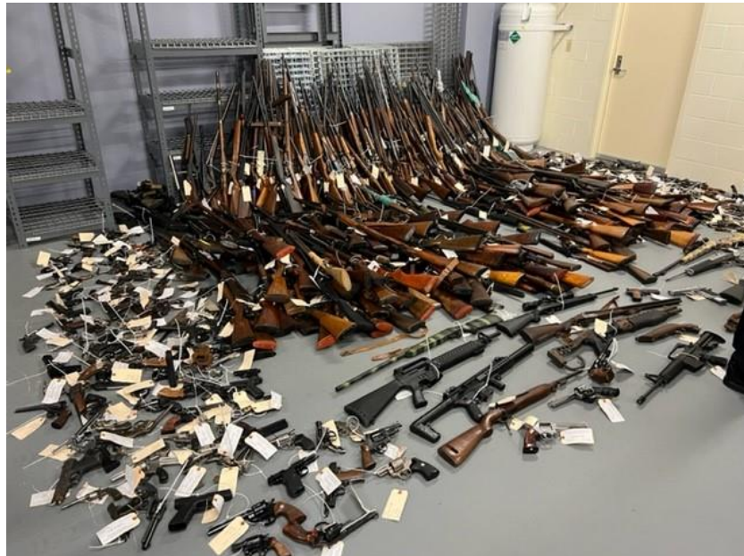
Figure 8. Firearms surrendered during the gun buyback program