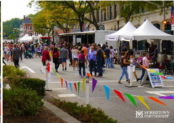
Figure 7 North Park Place at Festival on the Green