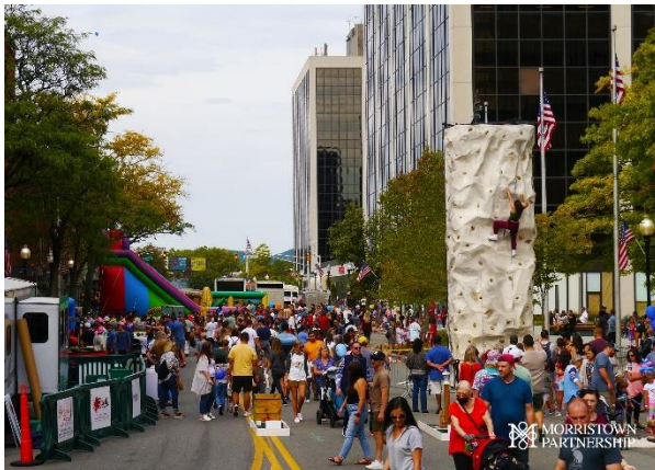
Figure 6 Kids Place at Festival on the Green

Project Overview: The Festival on the Green by Morristown Partnership is a free event for all attendees, welcoming approximately 50,000 visitors to the County seat every fall. Morristown Partnership suffered a severe loss of revenue from the COVID-19 pandemic through the lack of multiple events, including the annual Festival on the Green. The Festival on the Green supports small businesses, particularly those that buy a package price for a table, tent, and chairs to attract customers during the festival. Morristown Partnership was going to raise the 2021 participation package rates because equipment rental costs increased. On November 10, 2021, the County of Morris adopted RES-2021-945, committing $100,000.00 to keep costs to participating businesses the same as the 2019 costs. All reimbursements have been issued.