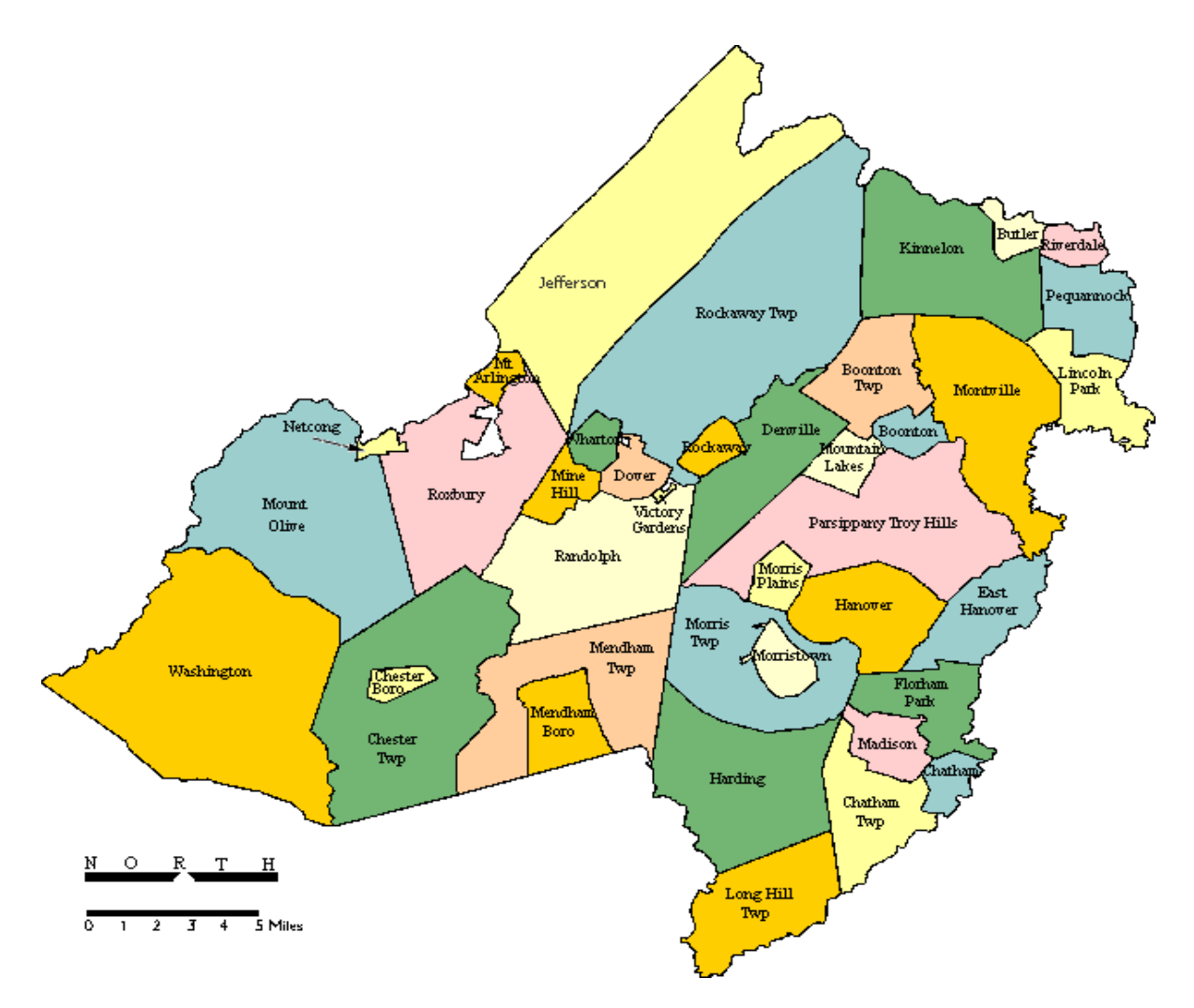
Please note that statistical and program information presented throughout this Plan is derived from Morris County planning and budget documents, information provided by County officials and Steering Committee members, US Census data, and other sources as noted in the attachments.